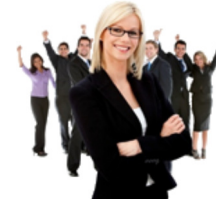
Improve client satisfaction scores

Qualified and interested candidates to fill difficult, critical, or highly visible reqs... or just to push more candidates into the pipeline wherever it may help. Professional, affordable, and proven sourcing utility offering direct outreach to passive talent who are often off the radar and "hidden".