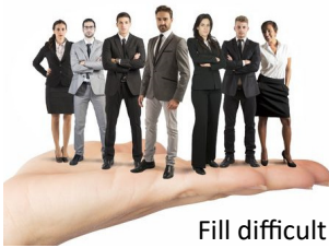
Fill difficult positions faster

Direct sourcing of hireable talent for tough-to-fill positions where quality, speed, and cost add up to an unbeatable value!